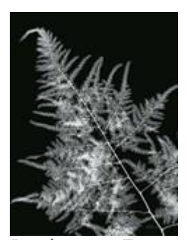
Luminescent Fern 2