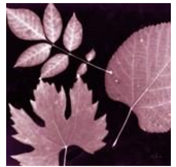
Cabernet Sunprint Leaves