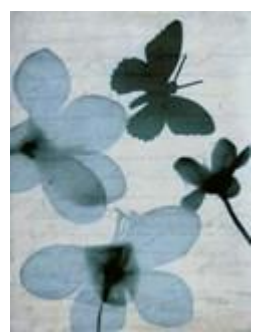
Beauty Of Light Blue 1