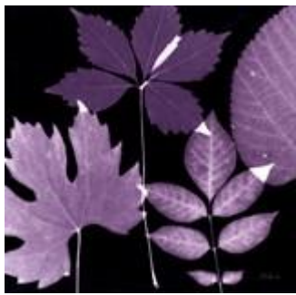
Plum Sunprint Leaves