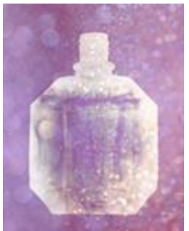
Essence of an Era 4