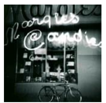
Candy In Lights