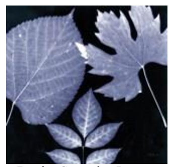
Denim Sunprint Leaves