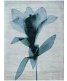
Beauty Of Light Blue 4