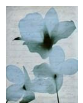
Beauty Of Light Blue 2