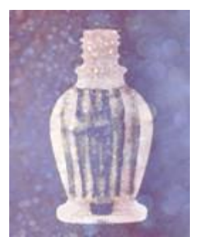
Essence of an Era 2