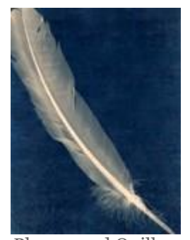
Plumes and Quills 1