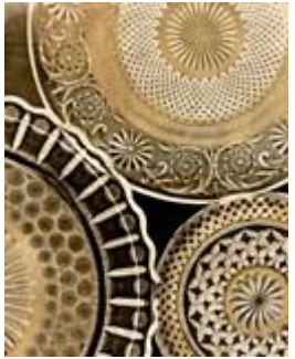
Light Drawings 1