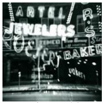
Storefront In Lights