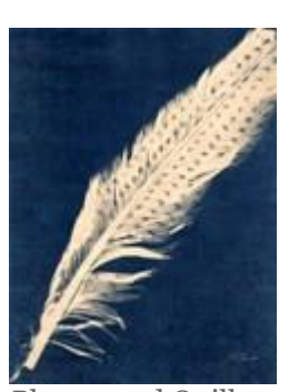
Plumes and Quills 3