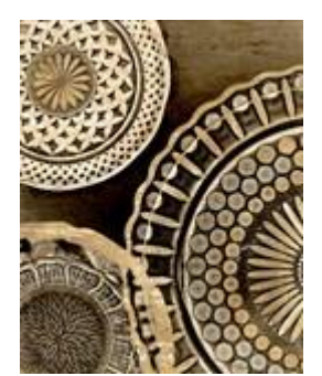
Light Drawings 2