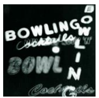
Bowling in lights